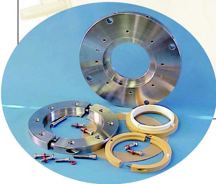
Left: Split AHS series seal