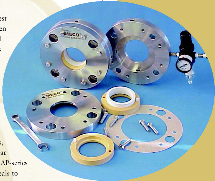
Above: Unsplit AHU seals

AH series seals are for use in low to moderate abrasive powder processes, on ribbon blenders and paddle mixers, reactors, screw conveyors, bucket elevators and similar blending or conveying machinery. AH and AP-series seals are also used as replacements for lip seals to isolate lube oil in bearings. These designs can be used in many cases where installation clearances are too tight to permit the use of other MECO seal types.